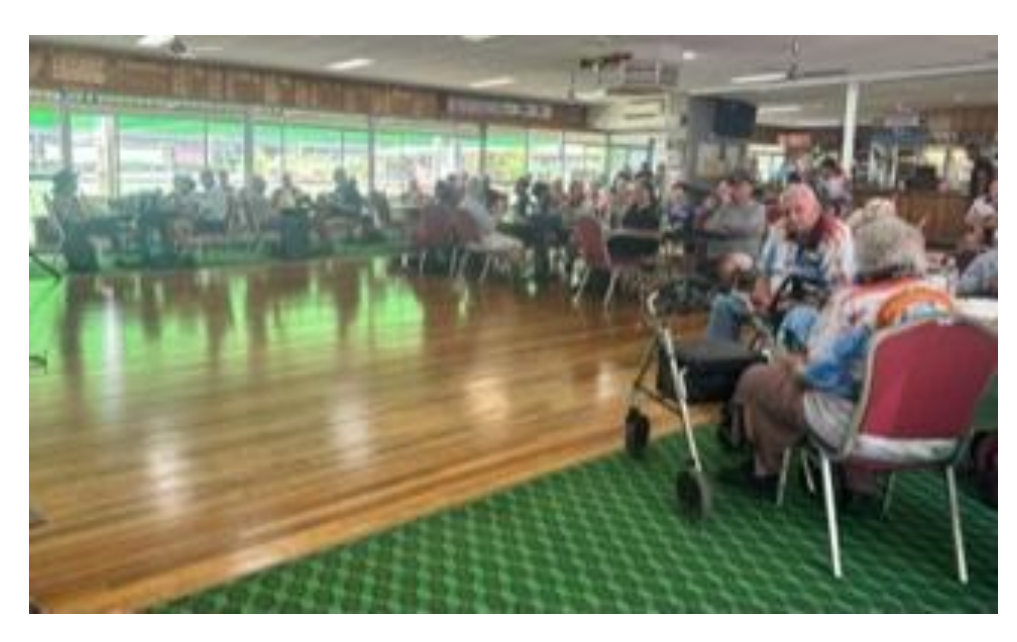
A huge turnout for our first social afternoon for 2023!