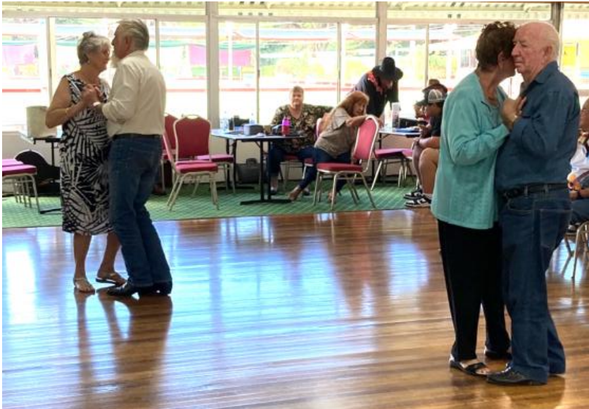
More people up dancing