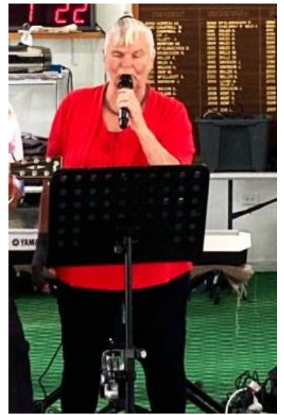
Our resident Rock 'n' Rollers