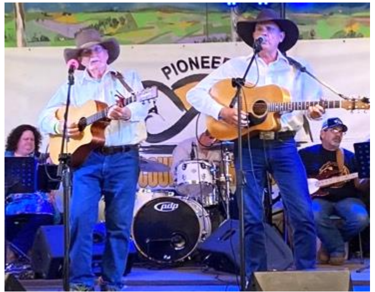
Townsville Club members