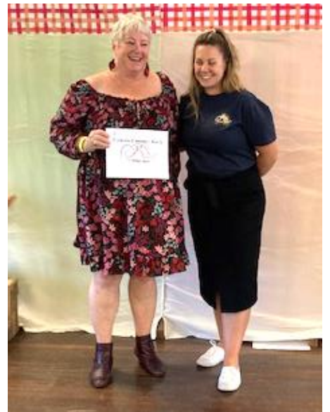
Female Country Rock