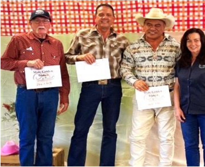
Male Golden Oldies