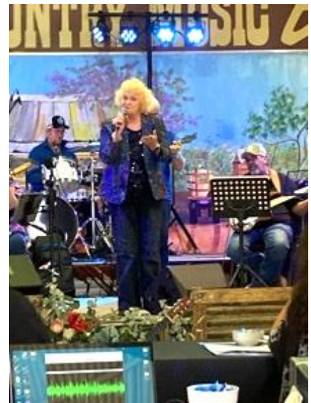
The Stun Guns