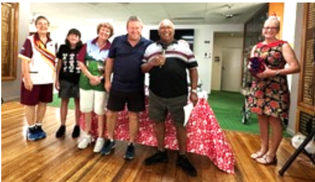
The great crew from Jubilee Bowls Club that catered for us and who always make us feel welcome